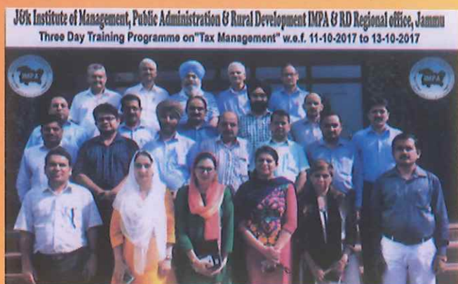
Training Course on "Tax Management" held at IMPARD Regional Centre, Jammu w.e.f. October 11-13, 2017