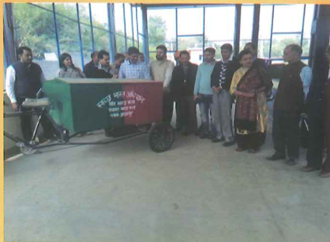
Training Course on "Behavioural Change Communication for Swachh Bharat Mission (Rural)" held at IMPARD Regional Centre, Jammu w.e.f. November 13-15, 2017

and field functionaries from Rural Development Department. The objective of the Course was to guide the participants in formulating strategies for creating clean and open defecation free gram panchayats and to familiarize them with effective methods and tools of Behavioural Changes. Also the participants were taken for a field visit to Solid Waste Management Centre at BhardaKalan in Akhnoor block.