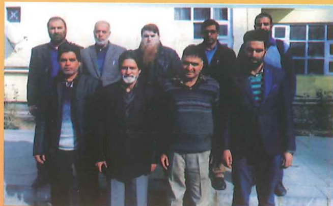
"Sensitization Programme on Recent Financial Reforms in Government" held at IMPARD Main Campus, Srinagar w.e.f. November 15-17, 2017