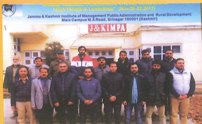
Training Course on "Disaster Resistant Construction in Areas Vulnerable to Flash Floods & Landslides" held at IMPARD Main Campus, Srinagar w.e.f. November 20-22, 2017