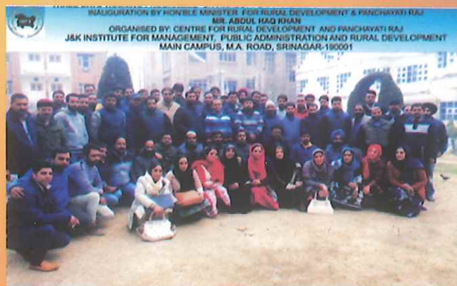
Training Course on "Framework on AWASOFT & other Software Applications" held at IMPARD Main Campus, Srinagar w.e.f. November 14-16, 2017

The Ministry of Panchayati Raj (MoPR) has undertaken e-Panchayat Mission Mode Project (e-Panchayat MMP) with a view to introduce and strengthen e-Governance in Panchayati Raj Institutions (PRIs) across the country and build associated capacities of the PRIs for effective adoption of the e-Governance initiative. On the other hand Ministry of Rural Development has introduced Pradhan Mantri Awas Yojana, also termed as "Housing for All", a flagship scheme to rehabilitate all people in permanent homes by 2022. In PMAY (Gramin), programme implementation