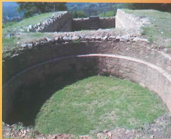
The participants of Training Course on "Heritage City Development and Augmentation Yojana (HRIDAY)" visited the Buddhist Stupa with Pebble Style Walls at Harvan, Srinagar