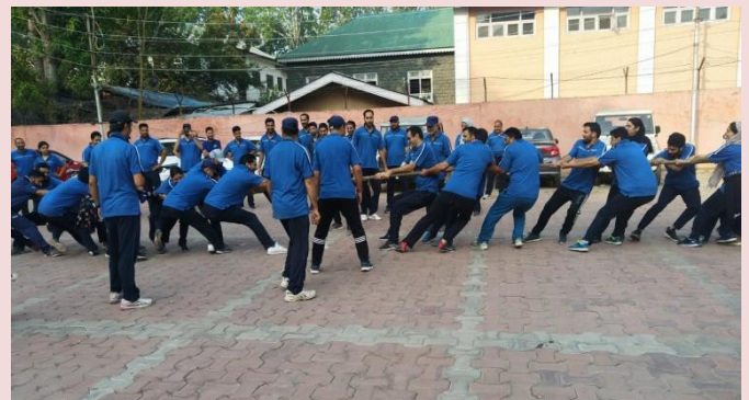
JKAS Probationers playing Tug-of-War at JKIMPARD, Srinagar