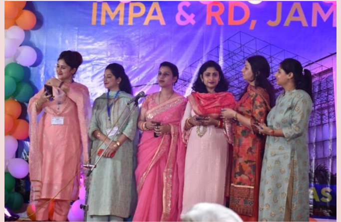
JKAS Probationers singing during cultural programme at IMPARD, Jammu