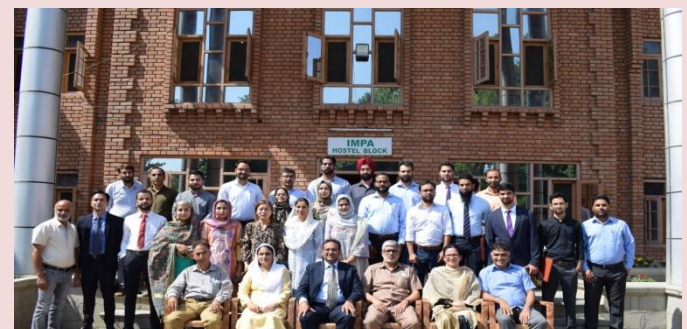
One Week's Offline Training Courses for JKAS Probationary Officers, Batch 2019 2 nd Group August 23-28, 2021