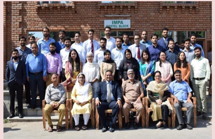
One Week's Offline Training Courses for JKAS Probationary Officers, Batch 2019 1 st Group August 16-21, 2021