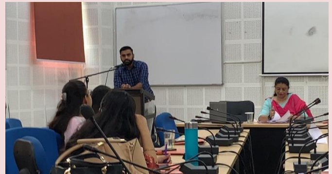
Presentations by Officer Trainees in progress at Central Hall, IMPARD Jammu