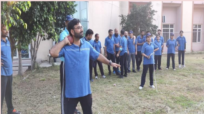
JKAS Probationers playing shot-put at IMPARD, Jammu