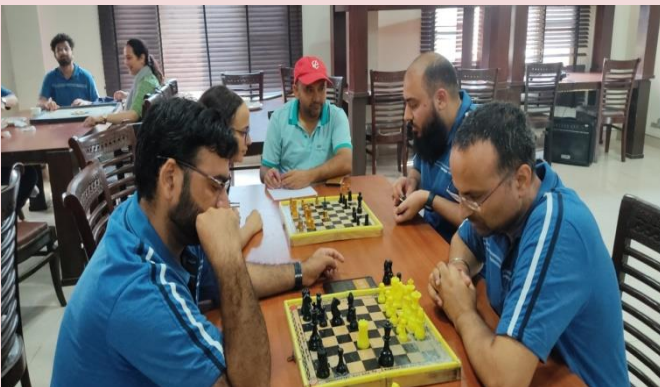
JKAS Probationers during chess competition at IMPARD, Jammu