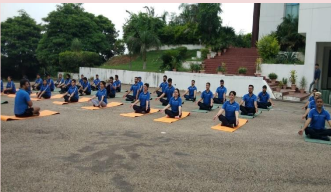
Yoga Session in progress at IMPARD Jammu