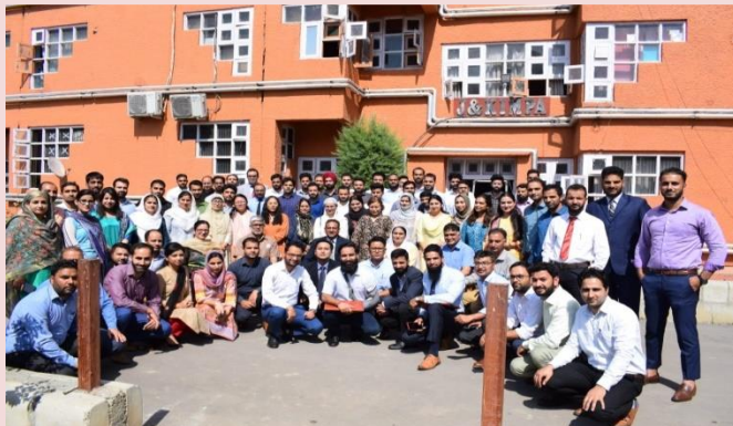
JKAS Probationers at JKIMPARD, Srinagar