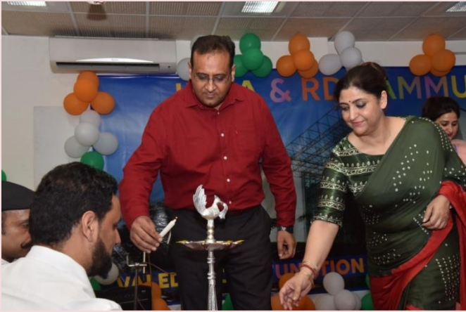
Lightening of Lamp Ceremony during the Cultural programme, at Jammu