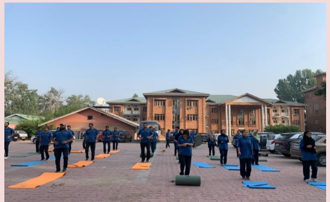
Yoga Session in progress at JKIMPARD, Srinagar