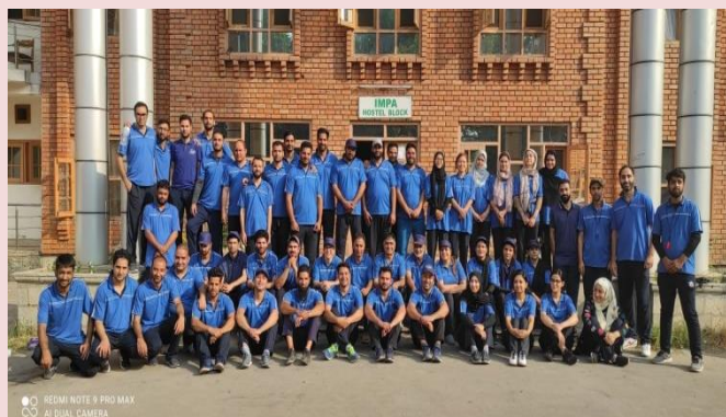
JKAS Probationers during Physical Training at J&K IMPARD, Srinagar