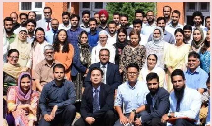
JKAS Probationers at J&K IMPARD, Srinagar