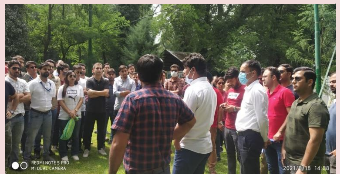
JKAS Probationers on Field Visit to Dachigam National Park