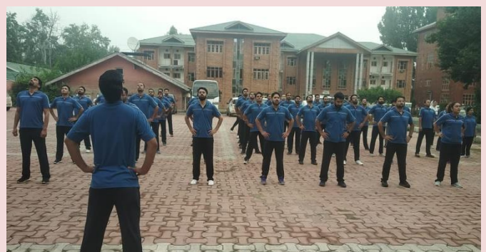
JKAS Probationers during Physical Training at JKIMPARD, Srinagar