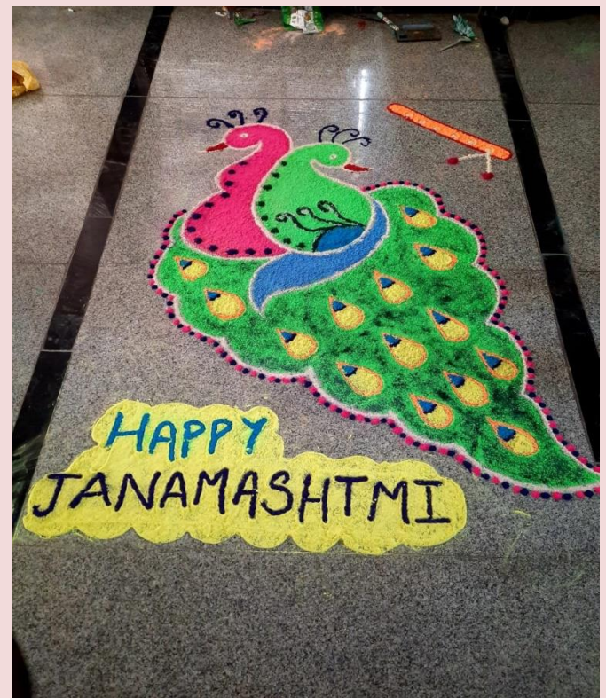
Beautiful Rangoli made by JKAS Probationers at IMPARD, Jammu