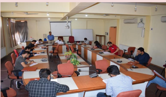
JKAS Probationers taking written examination at J&K IMPARD, Srinagar