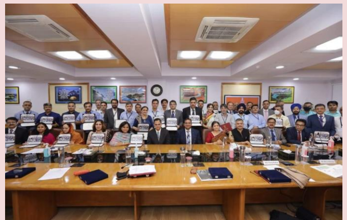
JKAS Officers undergoing Mid-career Training at Lal Bahadur Shastri National Academy of Administration (LBSNAA), Musoorie, under New Training Policy Adopted by J&K IMPARD