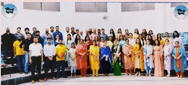
One Week's Offline Training Courses for JKAS Probationary Officers, Batch 2019 at J&K IMPARD, Regional Centre, Jammu