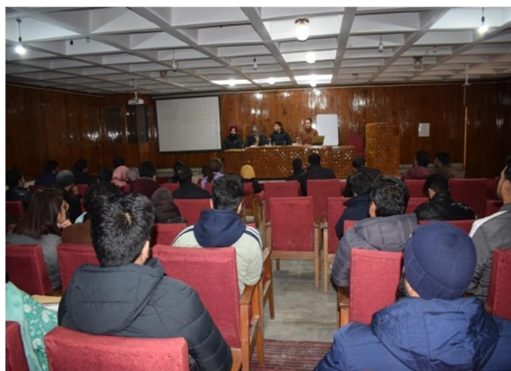
Interaction of KAS Probationers with the Director Census Operations