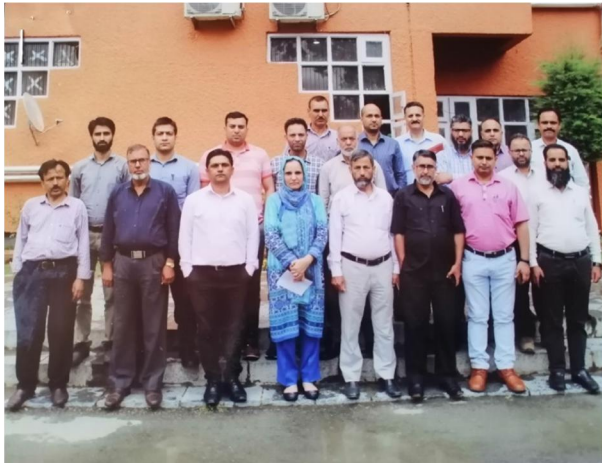
Orientation Training Course for Departmental Vigilance Officers conducted w.e.f July 25-27, 2019

performing their roles and responsibilities effectively and efficiently.