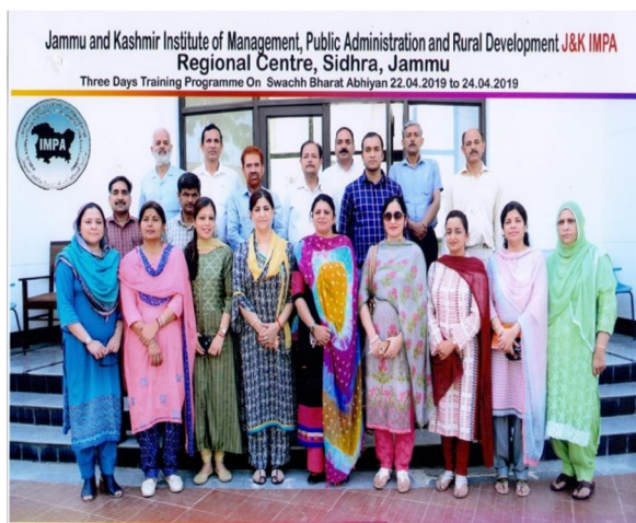
Training Course on 'Swachh Bharat Abhiyan' conducted w.e.f April 22-24, 2019