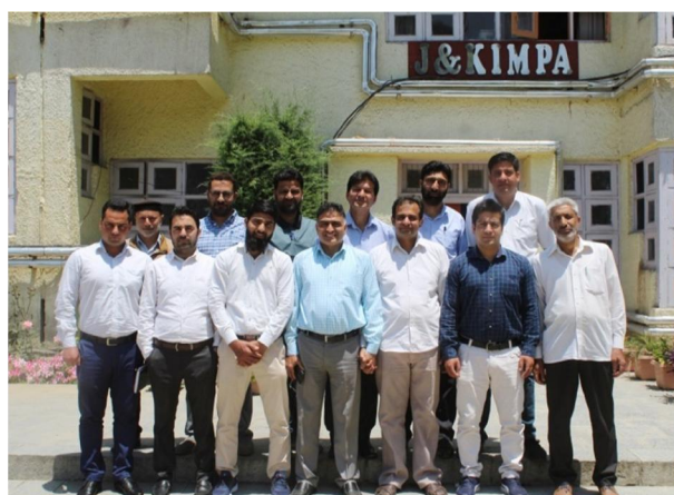
Training Course on 'Good Governance and Leadership Qualities' conducted w.e.f July 01-04, 2019

The concept of Good Governance as ensuring goodness in Governance and raising its level has always been the considered goal and persistent demand of the society. In the recent past the government has taken a number of initiatives to ensure good governance to the