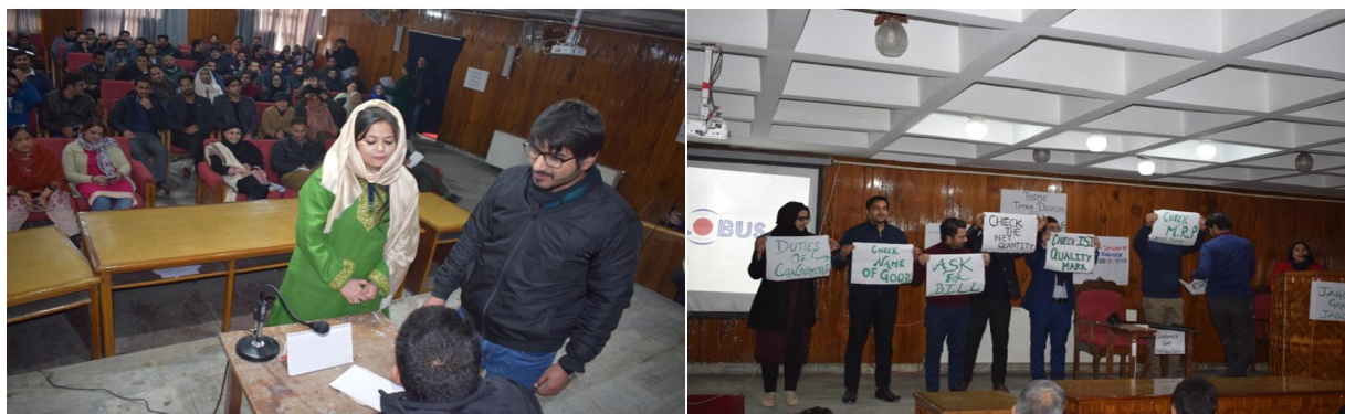
December 24 th , 2019 being observed as National Consumer Day