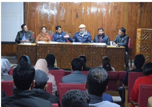
KAS: Career Prospects and Related Issues - Panel Discussion in Progress