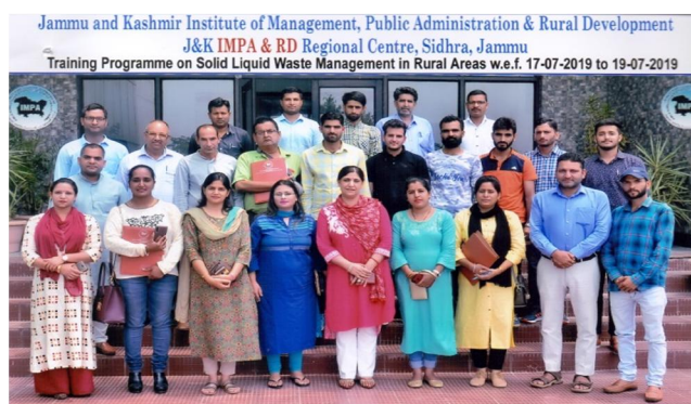
Training Course on 'Solid and Liquid Waste Management in Rural Areas' conducted w.e.f July 17-19, 2019

In India especially in rural areas, waste is a severe threat to the public health concern and cleanliness. Despite the waste generated (in rural areas) being predominantly organic and biodegradable, inappropriate disposal can lead to serious problems including the growth of water borne diseases such as diarrhoea, malaria, dengue, cholera and typhoid. Therefore, in order to equip the officers about proper planning and implementation of solid and liquid waste management and sensitize them about the innovations in rural sanitation, a three days training course on 'Solid and Liquid Waste Management in Rural Areas' was conducted at IMPARD, Jammu by the Centre for Rural Development and Panchayati Raj from July 17-19, 2019 under the coordinatorship of Dr. Ruchi Gupta, Assistant Professor.