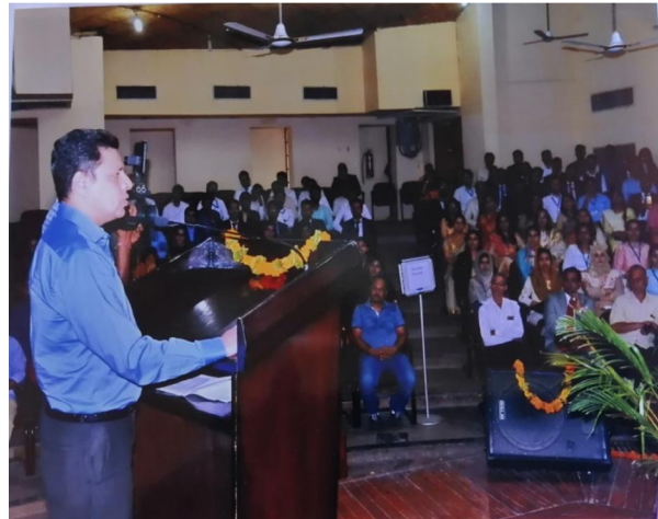
Inaugural Function of the Joint Foundation Course, 2019

inaugurated by Shri Sanjeev Verma, IAS, Divisional Commissioner, Jammu.