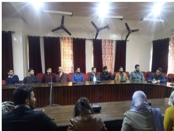
Trainees in the Meeting Hall of District Doda

the respective Districts, various categories of offices/ officials and the general masses as well.