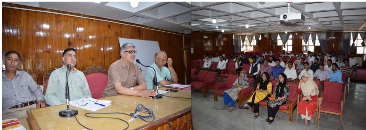
Joint Inauguration of the three Training Courses conducted in the month of July, 2019 at Srinagar Campus