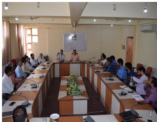
Training Course on 'Affirmative Action Programme for the Development of SCs, STs & OBCs in J&K: Planning and Management' conducted w.e.f July 23-25, 2019